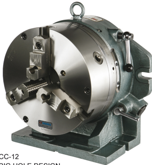
CC-12 BIG HOLE DESIGN