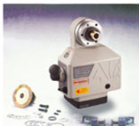
For Longitudinal X Axis