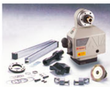
For Vertical Z Axis