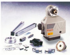
For Cross Y Axis