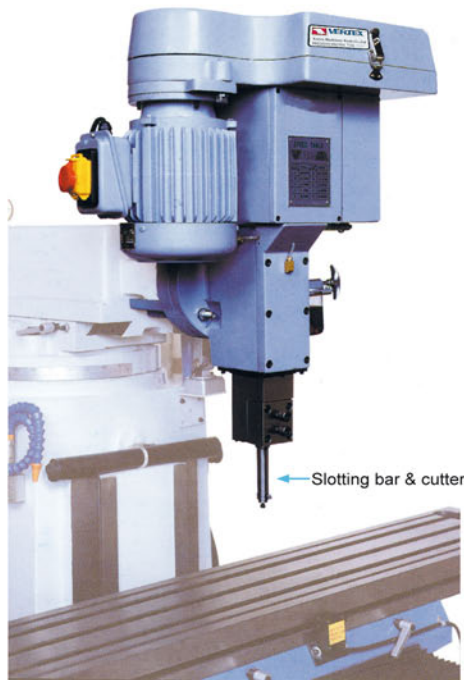
← Slotting bar & cutter