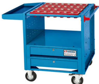
VTT-5 PACKING SET / 3 PAPER BOXES (2 DRAWERS/BOXES)