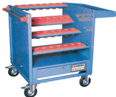
VTT-6 PACKING SET / 2 PAPER BOXES