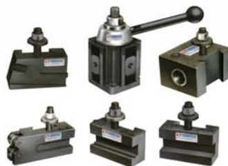
PISTON TYPE SETS VTP-□□□□ TYPE BODY WITH 6 PCS HOLDER