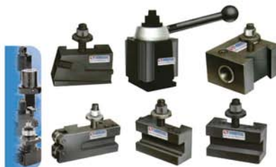
WEDGE TYPE SETS VTP-□□□□W TYPE BODY WITH 6 PCS HOLDER